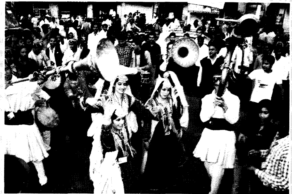
A view of Cultural Rally during North Zone Youth Festival 2010 at Jhansi University