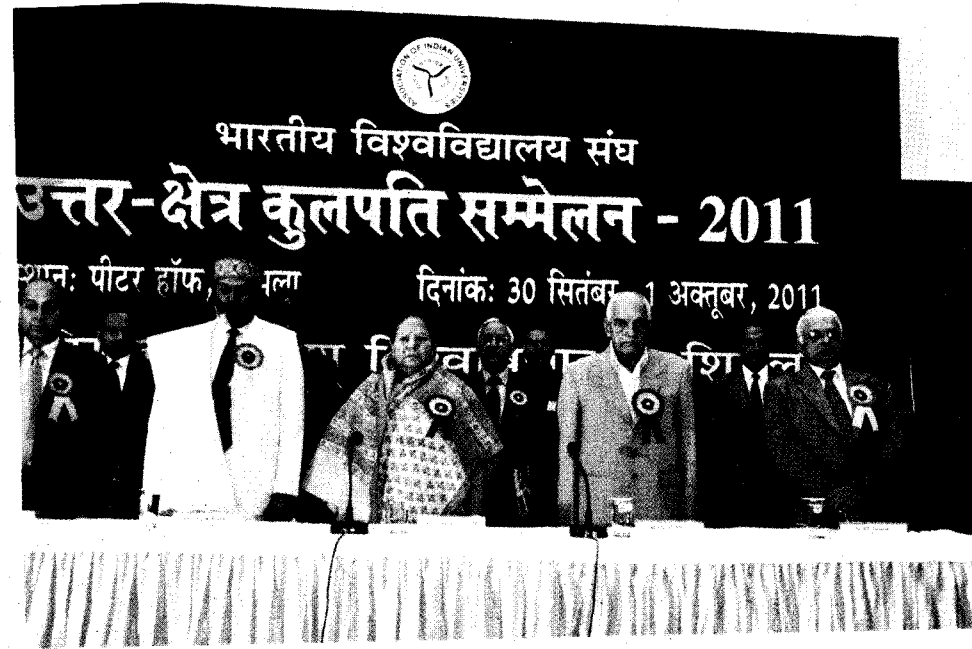
Inaugural Session of North Zone VCs' Meeting held at Himachal Pradesh University, Shimla (HP)