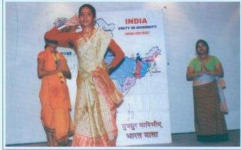
One Act Play being presented by Gujarat University, Gujarat at SAUPEST 2007, at SNDT Women's University Mumbai