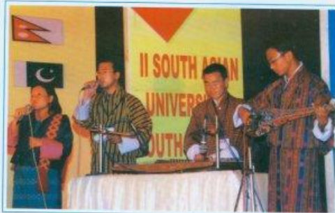
Bhutanese Contingent presenting Folk Orchestra at SAUFEST 2007 at SNDT Women's University, Mumbai