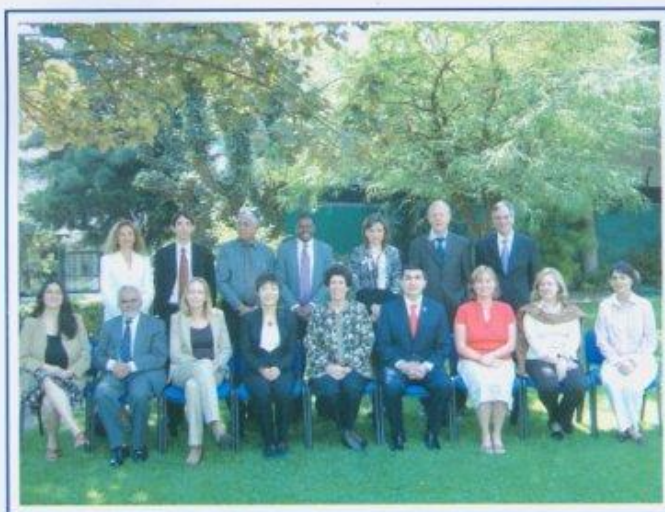
AIU Signed a Memorandum of Understanding with International Institute Education, New York