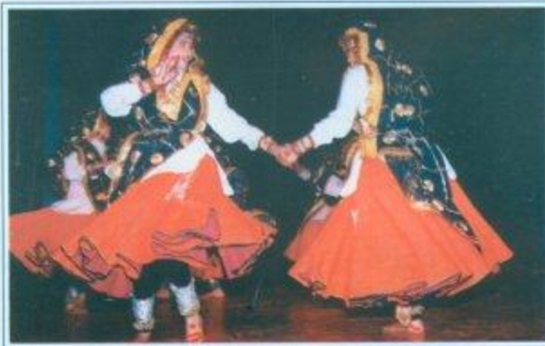
Folk Dance going on at North Zone Youth Festival 2006-07 held at Guru Nanak Dev University, Amritsar