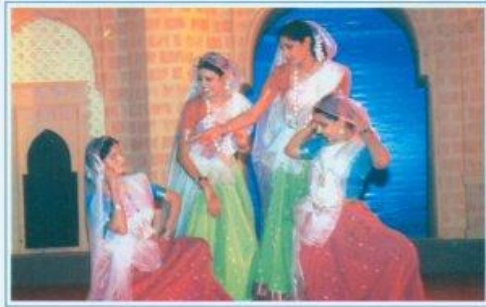
A Scene of Dance Ballet during SAUPEST 2007 at SNDT Women's University Mumbai