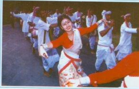
A glimpse of Cultural Rally during East Zone Youth Festival 2006-07 at BIT , Moira Raichy