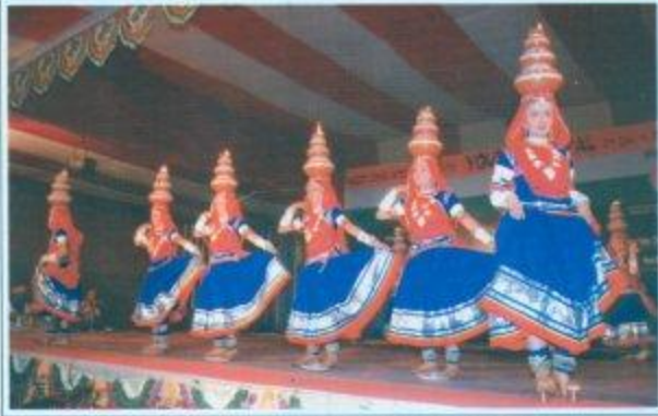
Erithvadi Folk Dance by Banasthal Vidyapeeth, Banasthal during West Zone Youth Festival 2006-07.